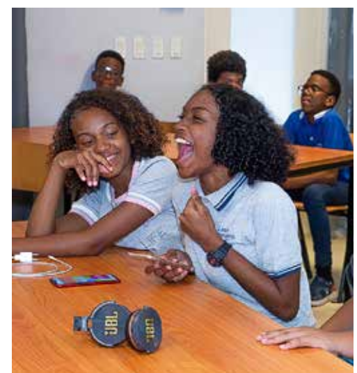
Bonaire's kids acing the BLNQ in 2019